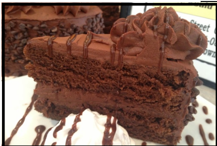
Chocolate Devils Food Fudge Cake