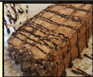
Chocolate Cappuccino Cream Torte

Flourless chocolate cake layered with a light mocha-cappuccino cream, topped with a rich chocolate ganache and mini chocolate chips...$8.99