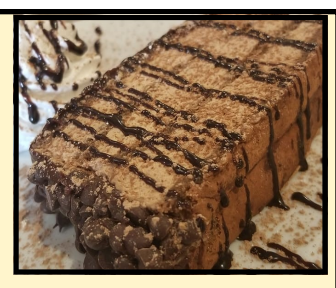
Chocolate Cappuccino Cream Torte

Flourless chocolate cake layered with a light mocha-cappuccino cream, topped with a rich chocolate ganache and mini chocolate chips...$8.99